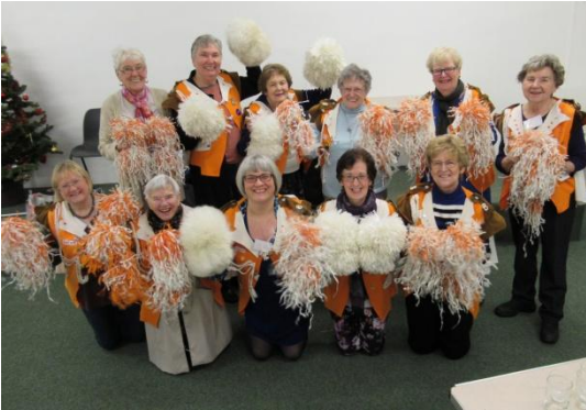
Welcome Wednesday members and helpers