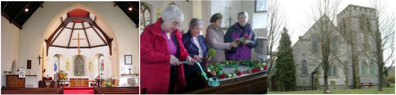
Making Mothering Sunday posies

Built in 1909-10 the church is prominently situated 1.5 miles to the south of Buxton in Harpur Hill village. It is built on rising ground to the east of the roadway and comprises: the South West Tower, three bay Nave, a former Baptistry, Porch to the west, two bay apsidal Chancel, north vestries and organ chamber plus a cellar.