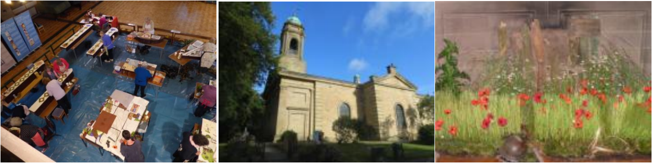
Preparing Well Dressing displays