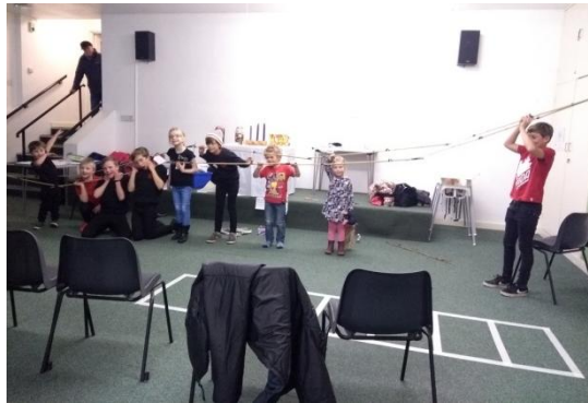
Having fun at Messy Church

There is a small but active Pastoral Care Group which visits the bereaved and those who are sick or nearing the end of life. Retired clergy and lay readers take communion to those who request it and also visit nursing and care homes to administer communion.