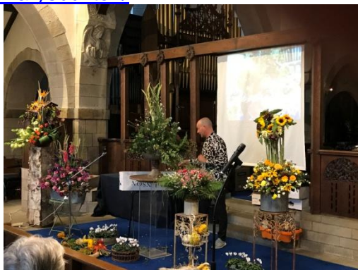
Flower arranging demonstration at St Mary's