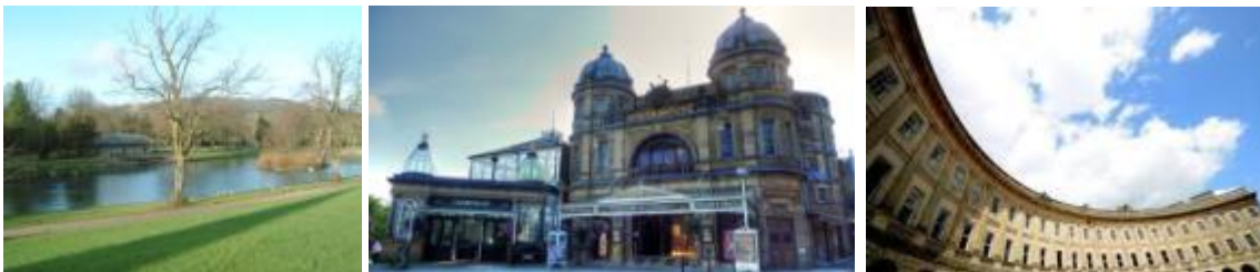
Heritage Lottery Fund

Buxton is a very special place, tracing its history through prehistoric limestone caves, a Roman settlement, elegant Georgian architecture and a Victorian park and gardens. The highest market town in England, it has a population of around 22,700 (16,200 in Buxton Parish and 6,500 in neighbouring Fairfield Parish), with 63% aged 16-64 and 25% aged 65 plus; only 2% of the population is non-white ( all data from 2011 census ).