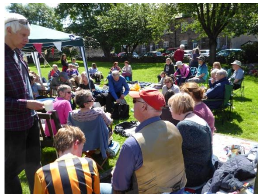
Community picnic at St Mary's