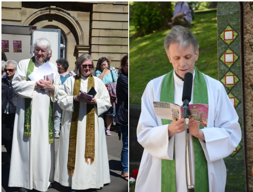
Members of the clergy team at the Blessing of the Wells

The University of Derby has its own active chaplaincy team, which includes one of the retired priests living in our team parish. We also have involvement in the University Chaplaincy Churches Liaison Committee. Our churches play a role in the civic life of Buxton, including services for the annual Wells Dressing festival, the crowning of the Well Dressing Queen and Remembrance Sunday, which are led by our clergy team.