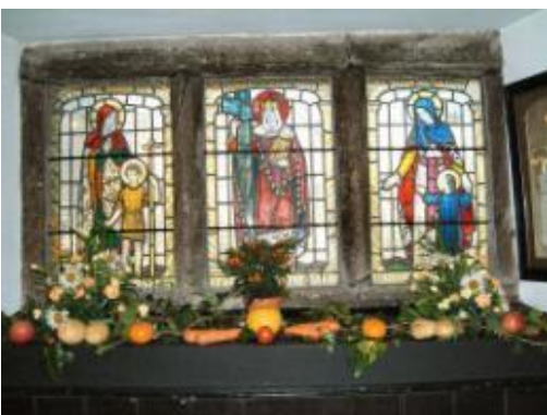
St Anne's flower festival

All our churches have varied programmes of social, fundraising and outreach activities, ranging from suppers, quiz nights and garden parties to coffee mornings, flower festivals and musical events.