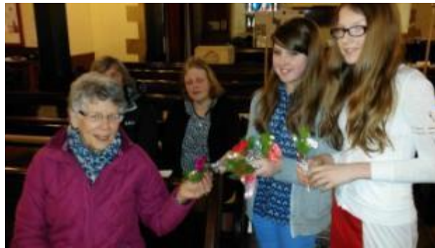
Presenting Mothering Sunday posies